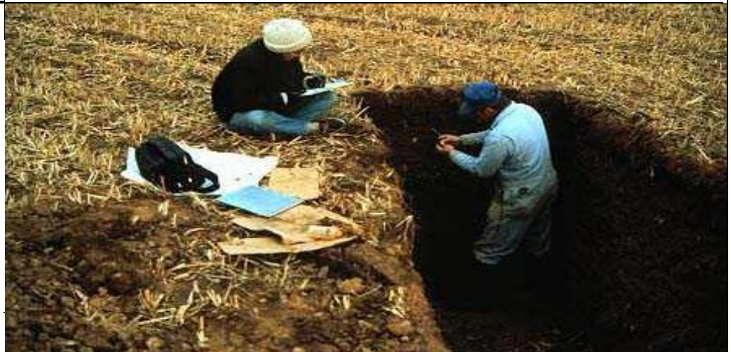
Example Profile Pit